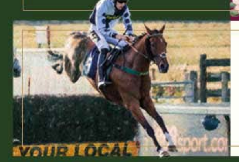
Dress up and get the girls together for a glamourous day of jump racing. The prosecco will be flowing!