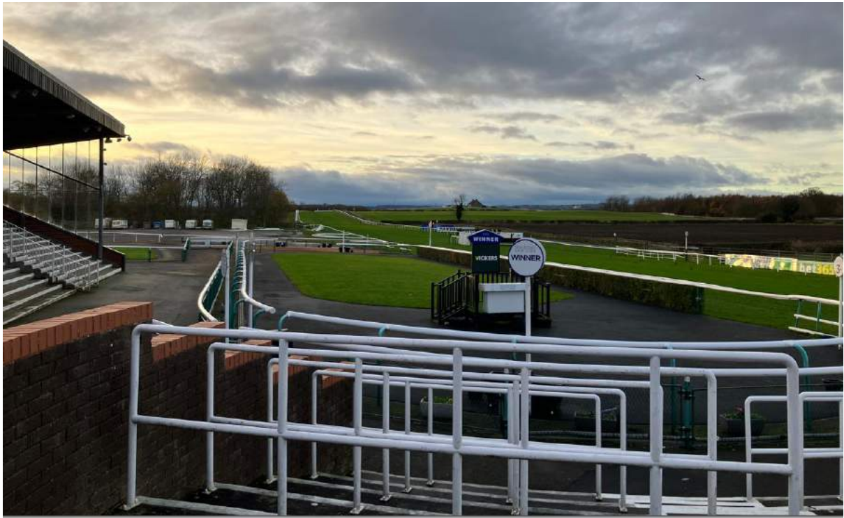
Proposed Viewing Area early 2024